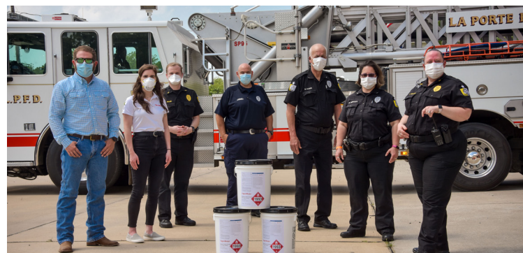
Sanitizer donation delivered to the La Porte Fire Department.